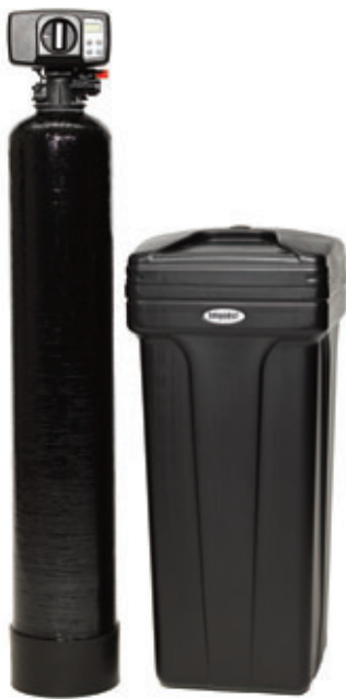
IWT 165 Water Softener

Hard water (calcium & magnesium) is a common problem for many homeowners and businesses. When hardness minerals are combined with heat it forms troublesome scale. Scale causes costly build-up in your plumbing, water heater and other water using appliances. When combined with soap, the minerals form soap curd or scum that makes skin dry and itchy, hair lifeless, laundry dull and builds up on fixtures.